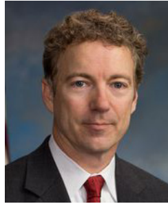
Senator Rand Paul