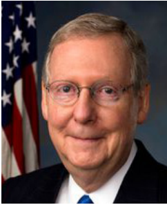
Senator Mitch McConnell