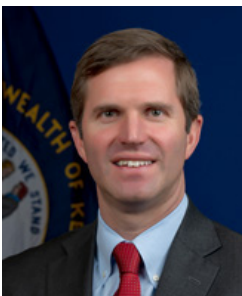
Andy Beshear Governor