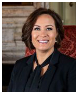
Jaqualine Coleman Lt. Governor